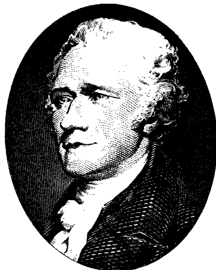
Must Hamilton make way for King?