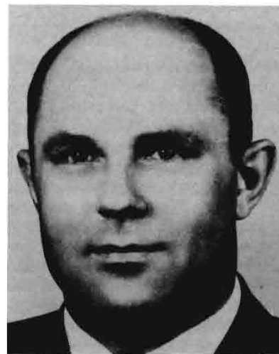
In Cleveland, 1958