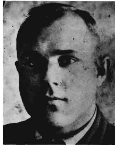
In West Germany, 1947